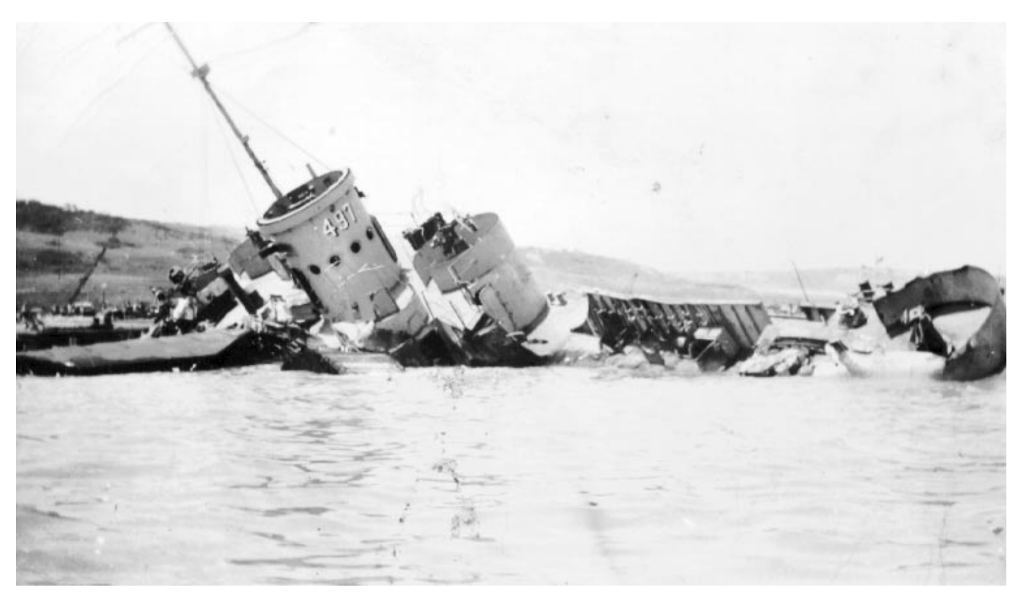
Moments before this picture was taken, Coxswain Jim Fetter, (left photo below) father of Eileen Zolotorofe, was operating "lead lines" (depth finders searching for sand bars) approximately two feet from the first explosion. The subsequent explosions killed eight of the army personnel on board. They abandoned ship (un-armed for the most part) and waded on to the beaches. Meet Eileen's dad at the May 24th meeting and hear "the rest of the story!"