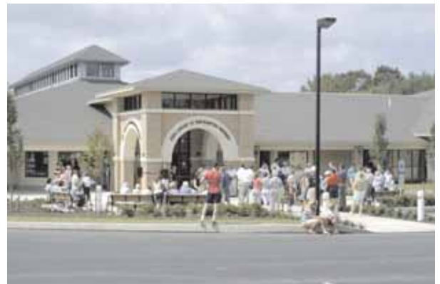
Library dedication at Northampton Days in September 2006, above first home was at the old Nike base, now the township recreation center.