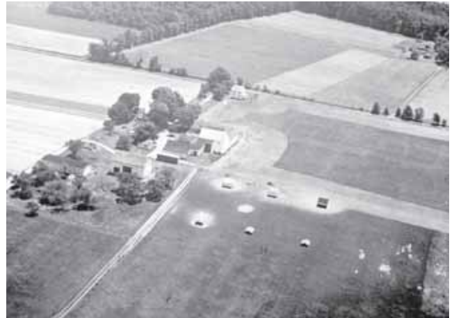
Above is aerial view of Jamison farm, now Tapestry, below is Long Lane farm owned by Windsor Eveland, Newtown/Richboro Road, east of Richboro, 1930's.

The film was sent to Hollywood for narration over dub by a voice over company, and seems to flow well with a slight audio track in the background. All footage was taken before the use of sound with film was invented.