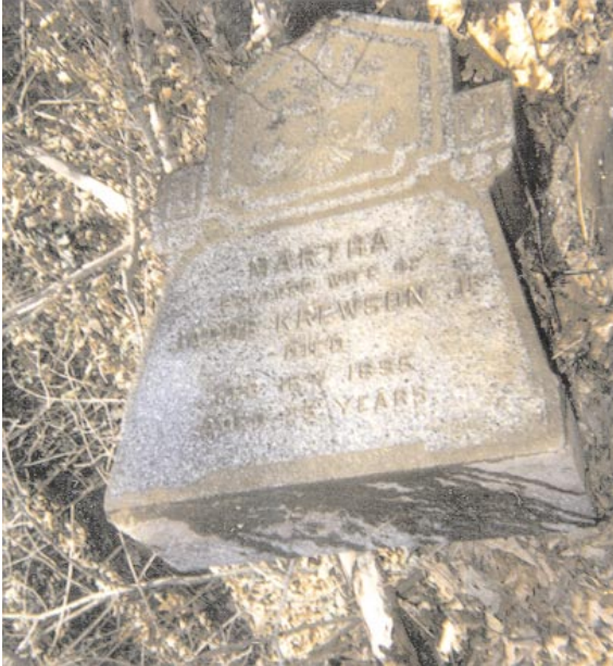
The Krewson Tombstone found by a contractor while digging on Tapeworm road