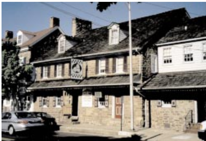
Top to Bottom, Left to Right - Court Inn, Newtown; Dublin Inn; Temperance House, Newtown; Spread Eagle, Richboro

This is the 30th issue of the HISTORIA published by the Northampton Township Historical Society Back issues are available on the Internet at: