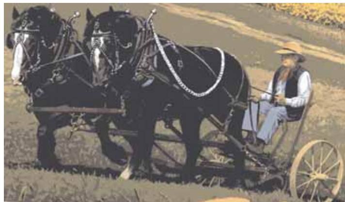
The way it looked in our fields in the early 20th century and before.