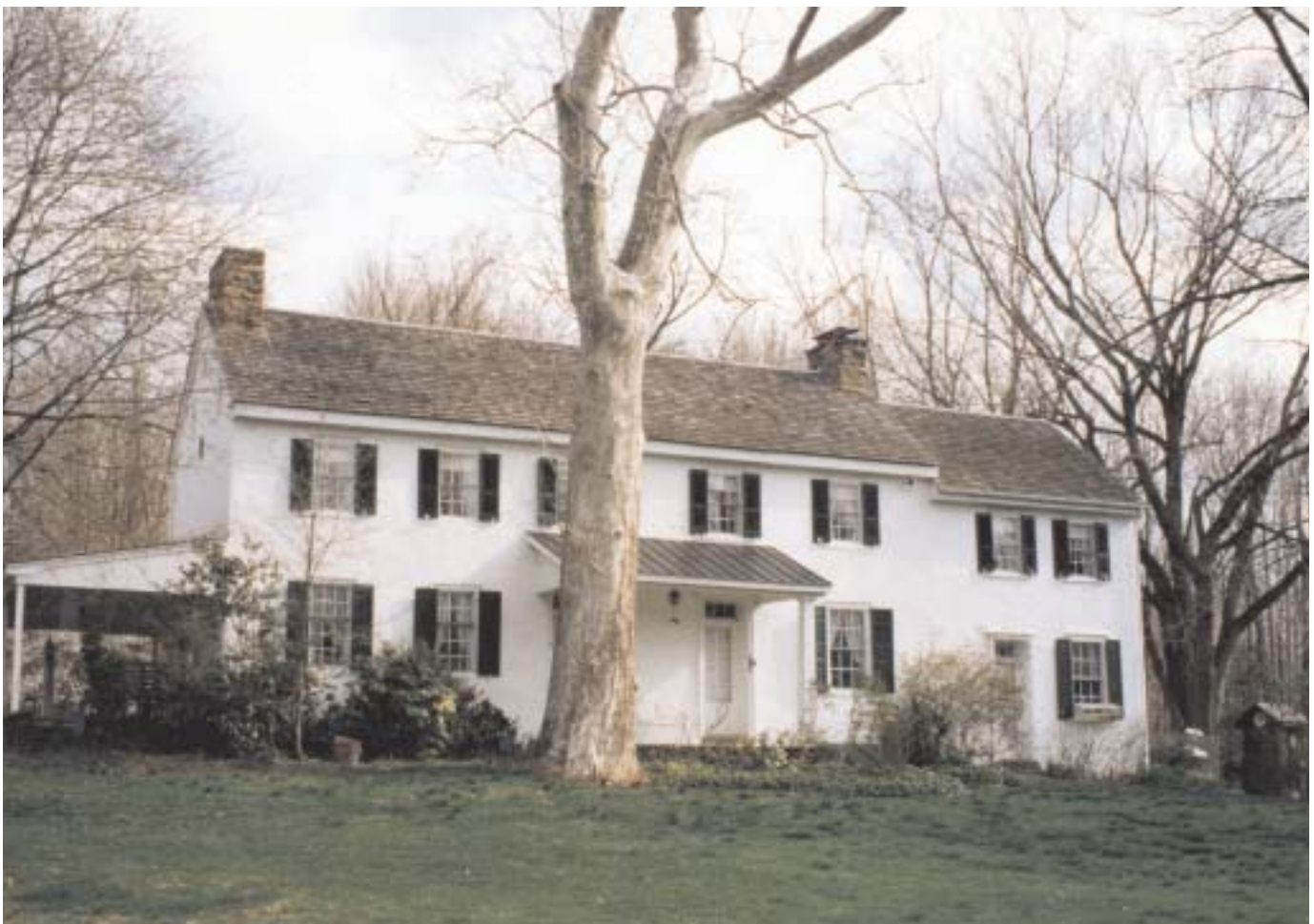
The Hull home as it looks today. Picture taken in the 1970’s.