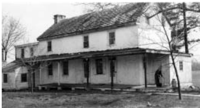
Top left - view of the springhouse today - right, in the early 20th century. Bottom left - Barn and right - rear of the house in the early 20th century