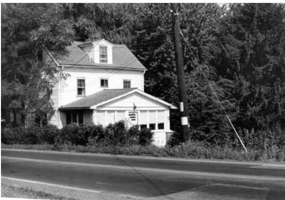
A 1974 view of the Bristol Road and Second Street pike toll house. Notice that Second street pike moved considerably to the east.