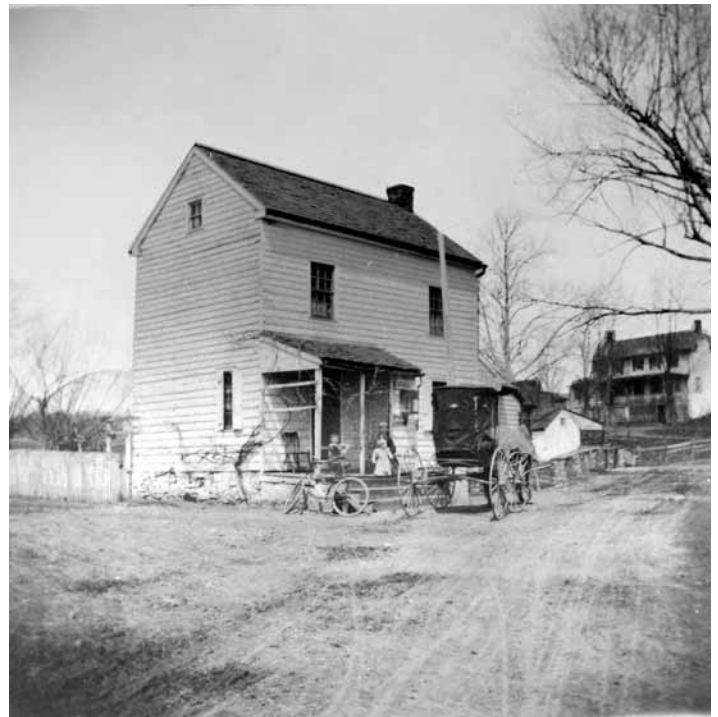
Another view of the house at the corner of Bristol Road and 2nd Street Pike from an Arnold Bros. postcard. (undated).

Notice is published in the Doylestown papers to the effect that on January 28th, a petition of twenty-five or more resident taxpayers of this county will be present to the Court of Quarter Sessions at Doylestown, praying the Court for the appointment of a jury of view, consisting of five reputable citizens of the county to view and condemn the Richboro and Pineville turnpike road, which extends from Richboro, through the village of Penn's Park and by the Anchor tavern, to the village of Pineville. The company has paid no dividend for many years, possibly never, and at this time it is difficult to locate some of the stockholders. The act authorizing the incorporation of the company was passed by the Legislature of 1848, and was signed by Governor Francis R. Shunk, on March 3d of that year. No doubt the road was constructed soon after that date, probably the following summer.