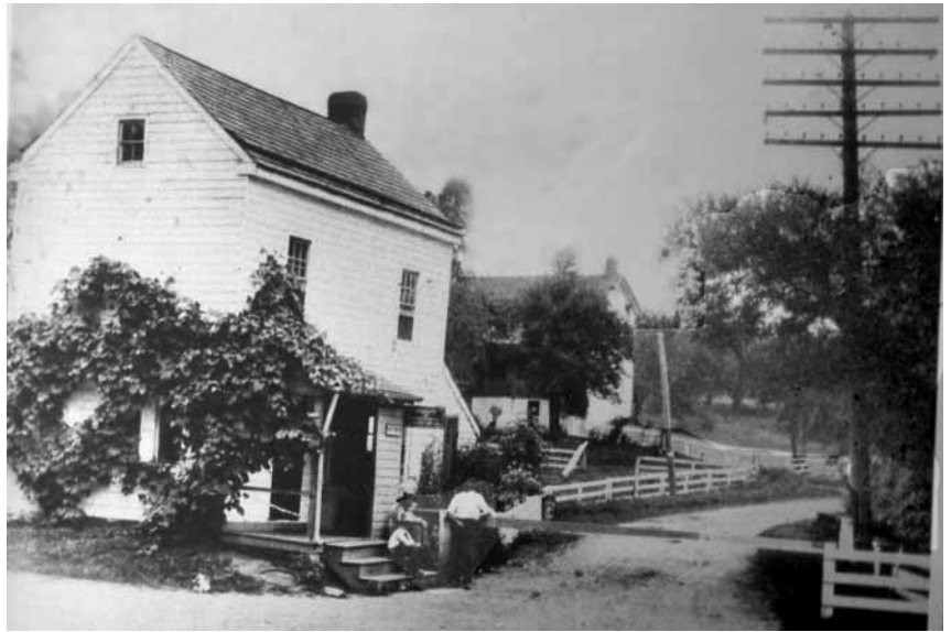
Toll gate at Northwest corner of Bristol road and Second Street Pike (then Middle Road) with the gate down and waiting for customers. c. 1915